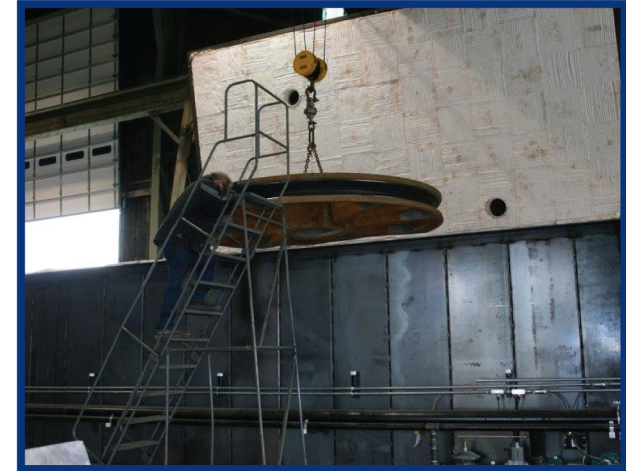
Our Gas fired, non-atmosphere controlled oven measures 15' x 25' x 8' deep. Temperature rated to 1600 F. Thermocouples are available for ASME certified loads.