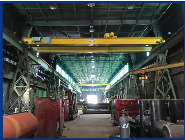
8 Overhead Cranes, 24' under hook - 25 Ton Lifting Capacity - 13 Jib Cranes