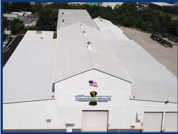
Schoellhorn-Albrecht has two facilities and more than 70,000 sq feet of fabrication capacity