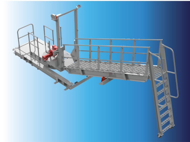
Vessel Access Systems