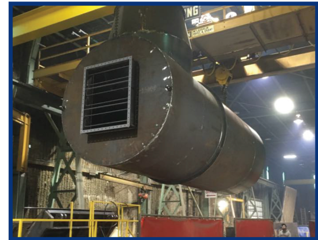
Custom Heavy Fabrication: 20' diameter 42' tall when assembled & made from abrasion resistant steel.